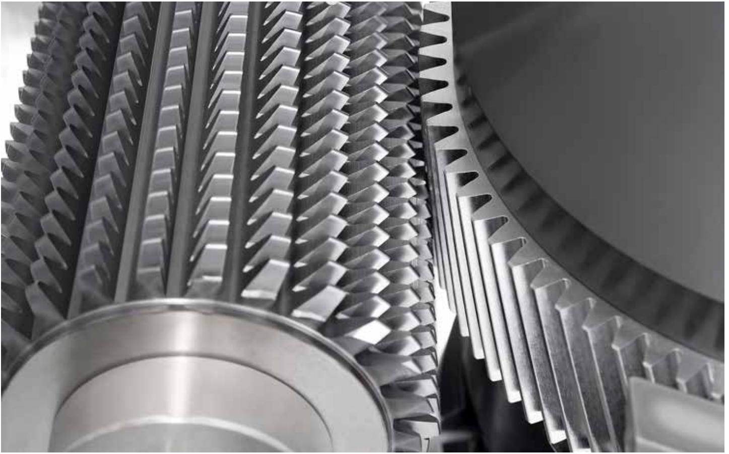
Dry hobbing of final drive ring gear with G50 hob material and AlCroNite® Pro coating for highest efficiency.

just 1 cent for the typical automotive workpiece.