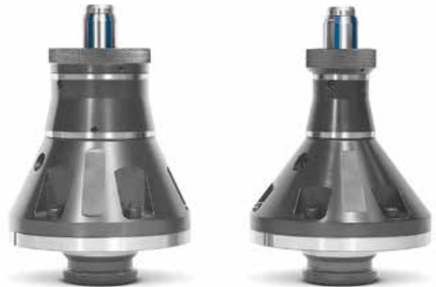
Quick-Flex® Plus clamping fixture for hobbing and Chamfer Hobbing cuts changeover time for different part types to just seconds.

A gear-driven hob head delivering speeds up to 2,000 rpm, combined with several hob clamping alternatives, ensures every application can benefit from the best possible cutting tool solutions, now and in the future. For dry cutting, for example, the latest G50, G90, or carbide hob cutter material is ideal. Several chip evacuation options