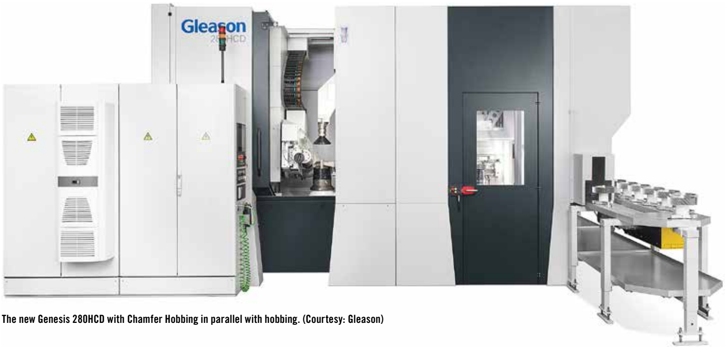
The new Genesis 280HCD with Chamfer Hobbing in parallel with hobbing.