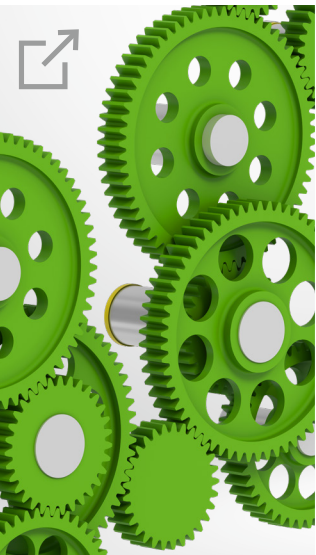
new KISSsoft Release 2026