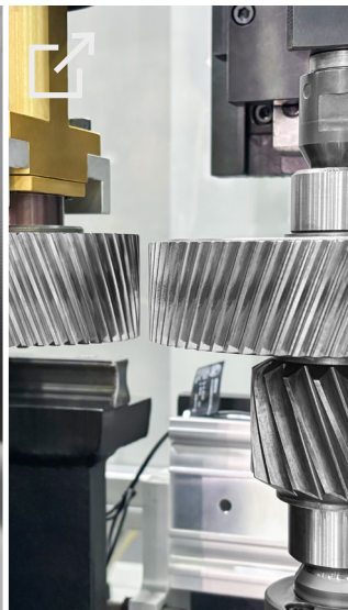
Intra double flank testing