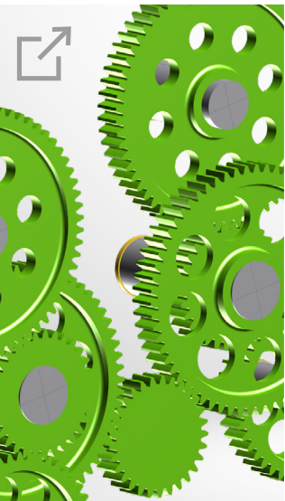
new KISSsoft Release 2026