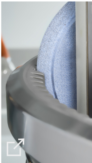
internal profile grinding