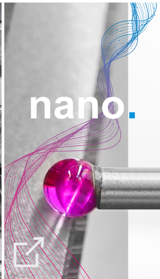
gear inspection at nano level