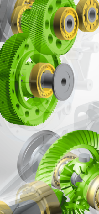
new KISSsoft System Module