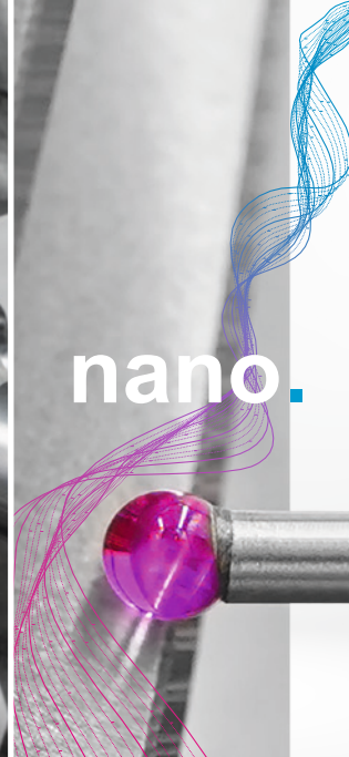
gear inspection at nano level