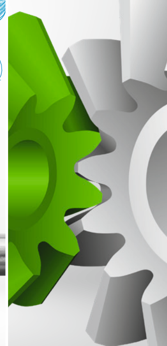
Coniflex Pro for straight bevel gears