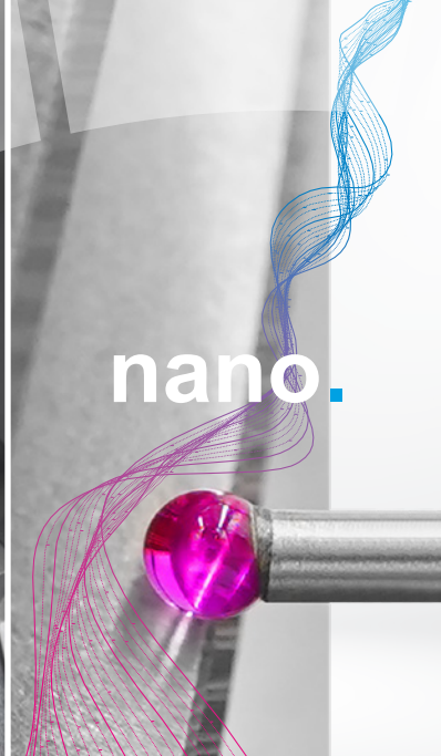
gear measuring at nano level