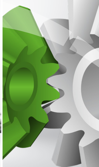
Coniflex Pro for straight bevel gears