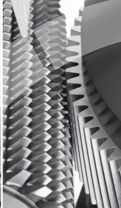
hobbing of spur and helical gears